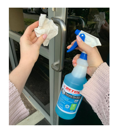
Use a general cleaner to remove any soils/debris from the surface