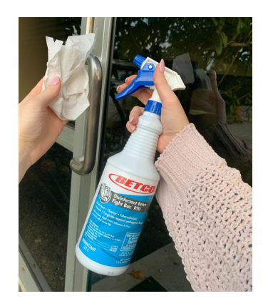
Spray disinfectant and allow sufficient contact time