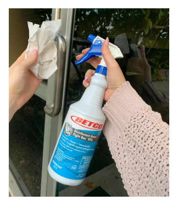
Spray disinfectant and allow sufficient contact time