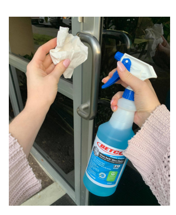
Use a general cleaner to remove any soils/debris from the surface

After you visit the EPA website, be sure to take note of the " contact time " given for the disinfectant you will be using. This is important because proper disinfection of a surface is usually a three-step process: (1) soils are removed; (2) disinfectant is sprayed or wiped on the surface; and (3) the surface must remain wet for the "contact time" recommended by the EPA before the surface is wiped-down. If the surface is clean, the first step is not needed